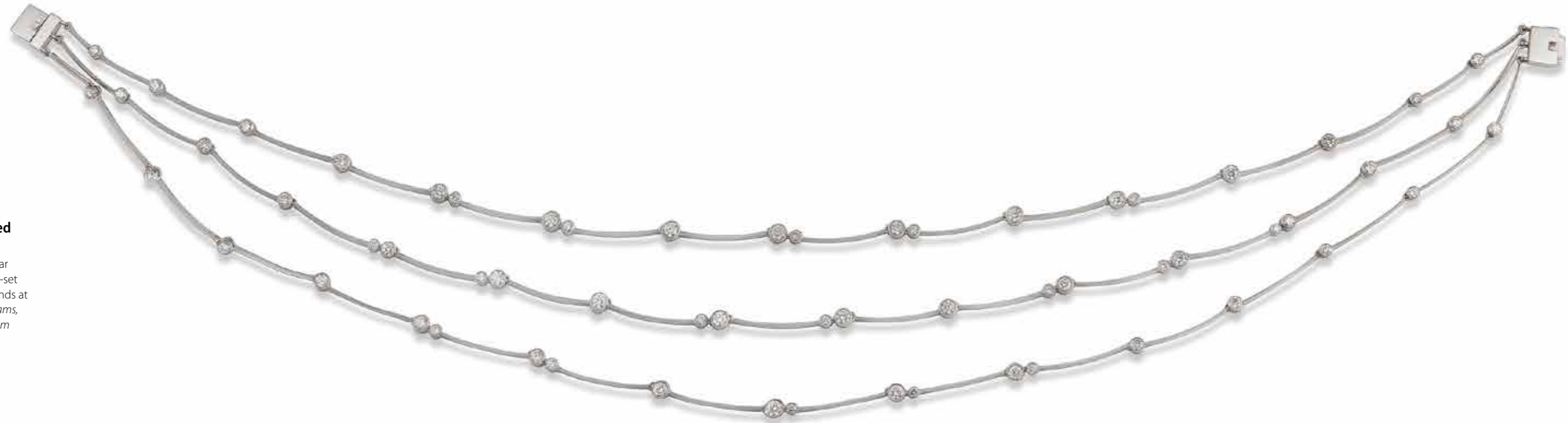
5 18k white gold three-tiered diamond necklace custom-made three-stranded bar necklace, with a total of 61 claw-set white round brilliant-cut diamonds at 7.88 carats, total weight 46.02 grams, longest length approximately 42cm R200 000 - 220 000