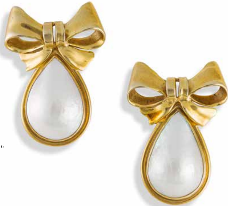
6 Pair of 9k yellow gold bowtie pearl drops earrings pear-shaped pearls of approximately 2.5 x 1.8cm, total drop length 3.5cm (2) R5 000 - 7 000