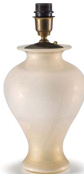
132 A pair of Barovier & Toso Murano gold-flecked cream glass table lamps, 20th century

*Strauss & Co does not guarantee electrical fittings