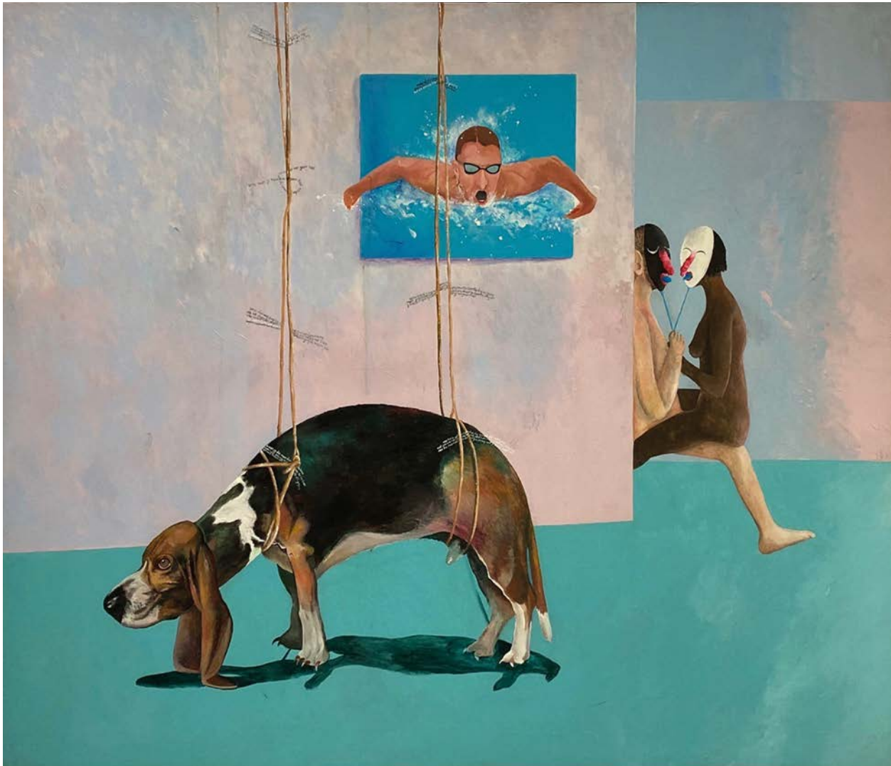
Breyten Breytenbach Hovering Dog R200 000–300 000 To be sold in Cape Town on 5 October 2020