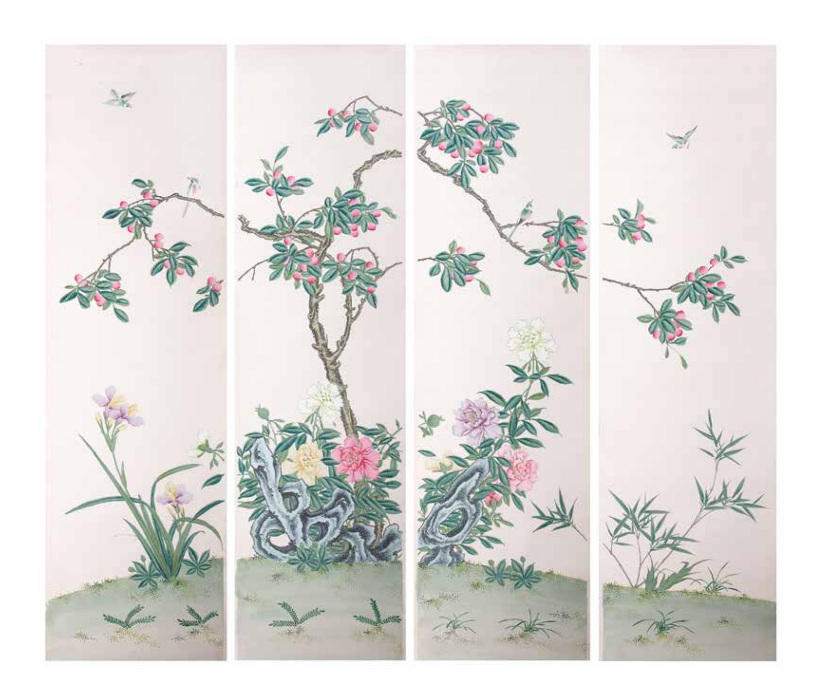
318 A set of four Chinese ink and colour paper scroll paintings, Republic period

each painted with birds amongst various blooms including irises, peonies, bamboo and sprays of prunus blossom with a rocky outcrop, some areas of staining, some areas of foxing, each 185 by 53,5cm, boxed (4)