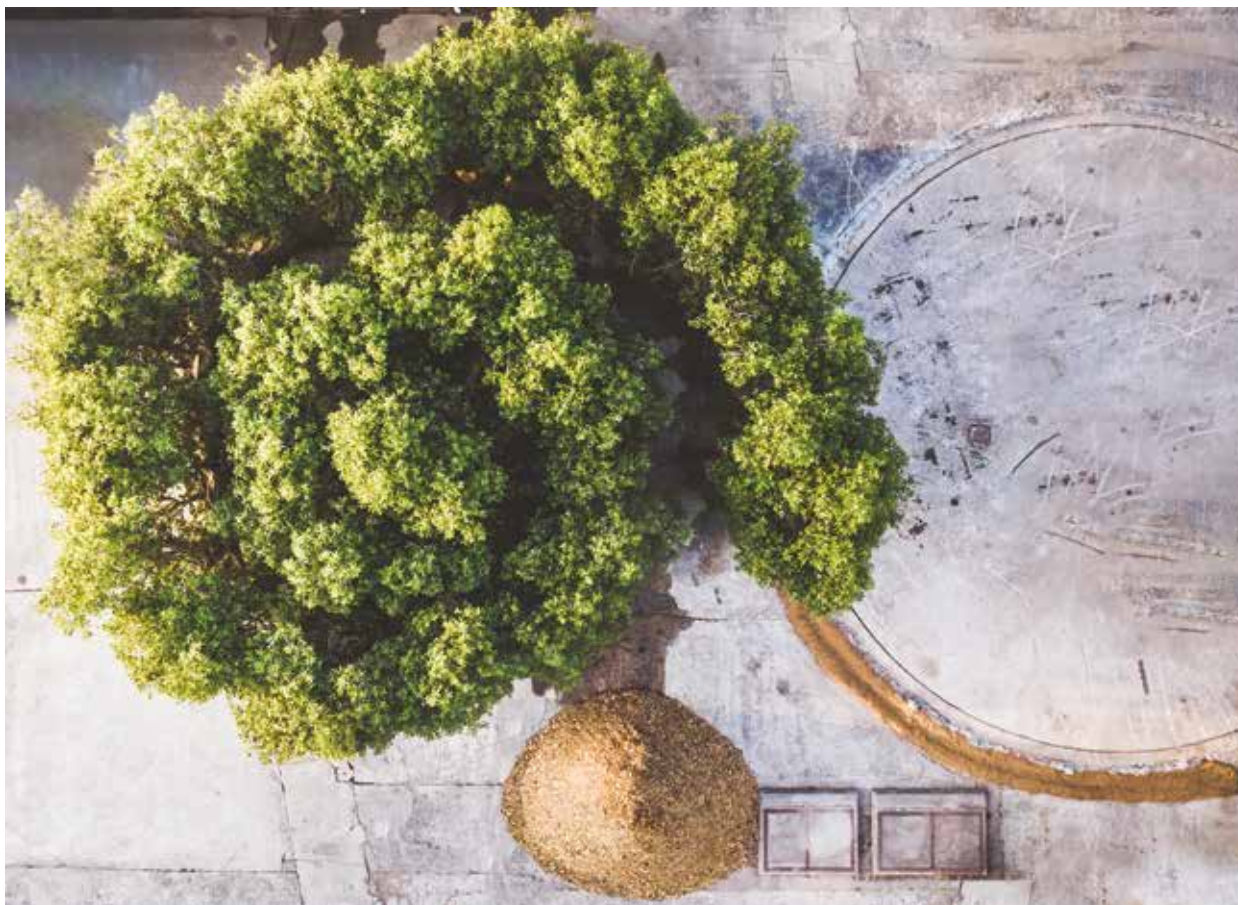
Pieter Colyn Environmental Land Art Installation BREATHE CONGO: A Reflection on the Growing Deforestation of Central Africa's Rainforest, 2020 Syzygium guineense trees, hessian fabric, wood chips, red earth, mirror Materials and Construction: Langverwacht Nursery and Langverwacht Landscaping

BREATHE CONGO is a living interactive land art piece. A spiralling path of trees. An opportunity to go inward and to reflect. Into the green. Into the breath. Honoring the Green Heart of Africa. The world's Second Lung. Our African Lung. A meditative path and an elemental gesture contemplating the beauty and fragility of our relationship and interdependence with one another and with our natural world.