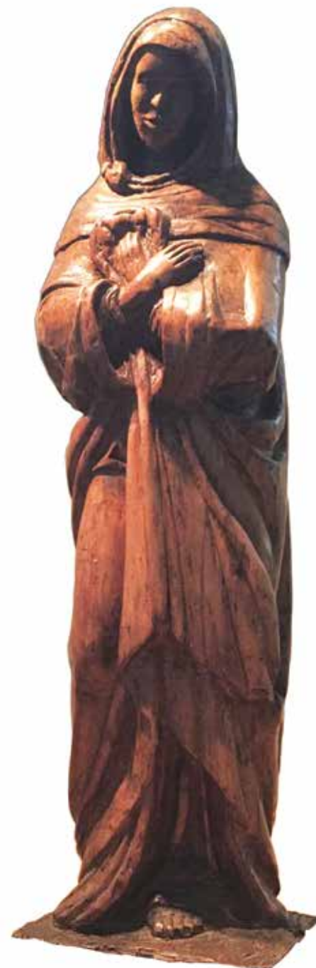
The Black Madonna , 1929, wood carving, 86 x 22 x 17 cm – collection of JAG

To buy a ticket: ErnestMancobaConference@gmail.com or contact 082 866 2601 (Winnie Sze)