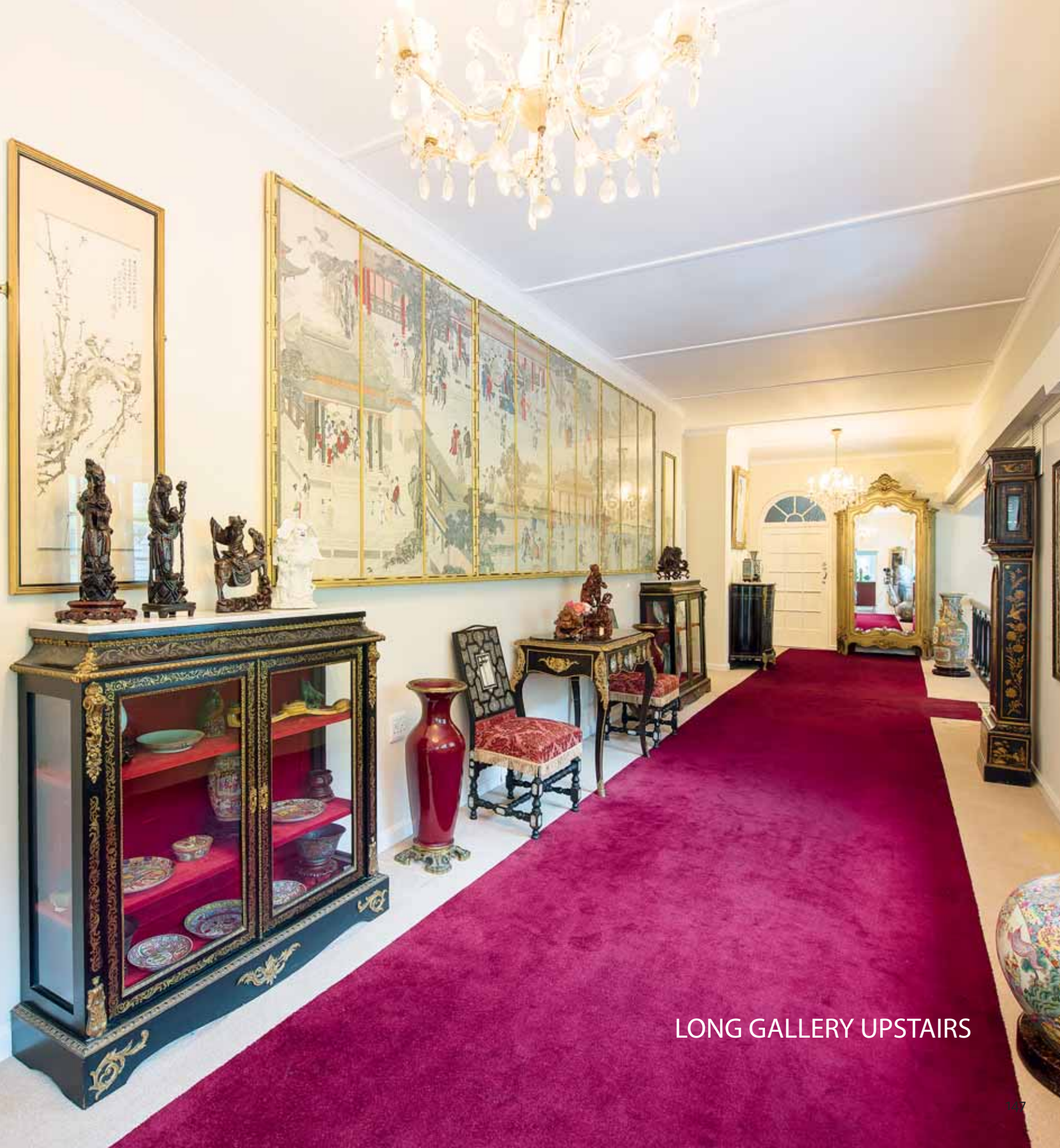
LONG GALLERY UPSTAIRS