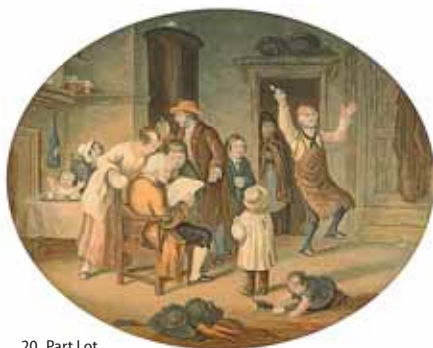
20 Part Lot