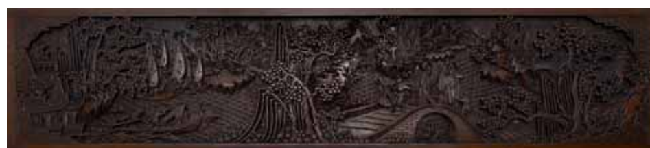
46 Part Lot