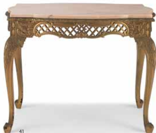
41 A painted gilt-metal and marble-topped table, 20th century

with rectangular shaped pink-veined marble top above a pierced lattice-work frieze, on cabriole legs and scroll feet, 80cm high, 104cm wide, 59cm deep