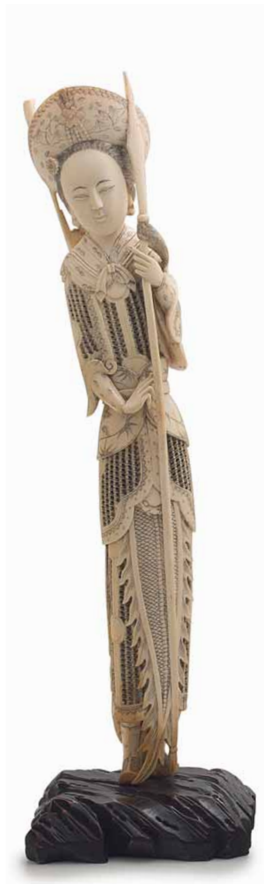
Lot 47 A Chinese ivory figure of a female warrior, Qing Dynasty, 19th/20th century (part lot) (see item in image on opposite page - bottom left)