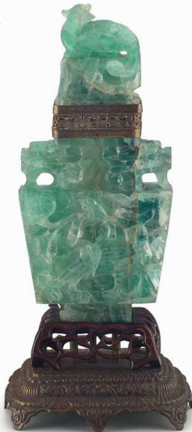
Lot 188 A pair of Chinese green fluorite crystal and gilt-metal mounted vases and covers, late 19th century (part lot) (see item in image on opposite page - bottom left)

It is with great pleasure that Strauss & Co will auction the contents of Harcroft House in Constantia, Cape Town on 18 November 2019.