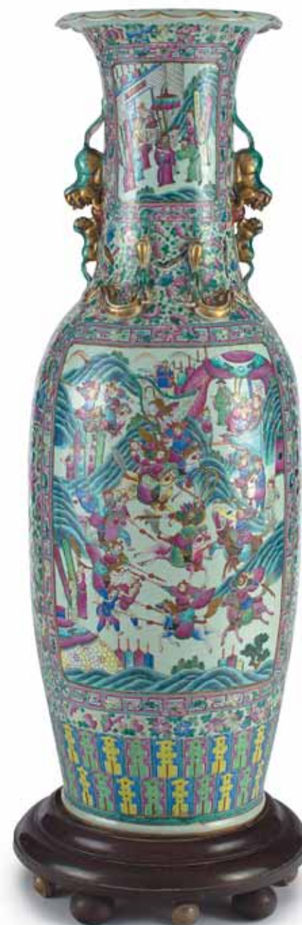
Lot 16 A large Canton famille-rose vase, Qing dynasty, late 19th century

All purchased lots must be collected from Harcroft House by 5pm on Thursday 21 November 2019, unless otherwise stated. Uncollected lots will be removed by Stuttaford Van Lines to their warehouse. Removal and insurance charges are at the buyer's expense.