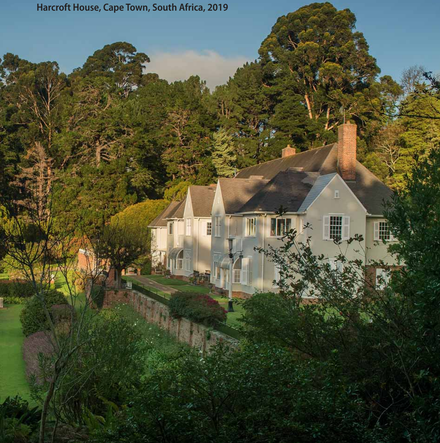
Harcroft House, Cape Town, South Africa, 2019