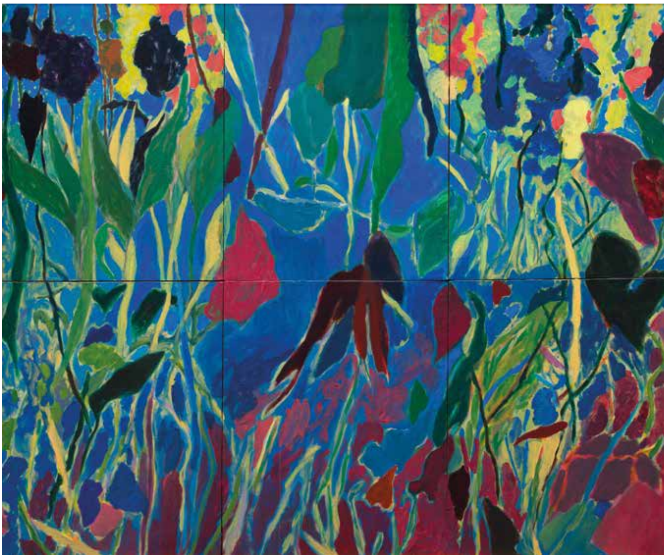
Andrew Verster Swamps No.5 R100 000 – 150 000