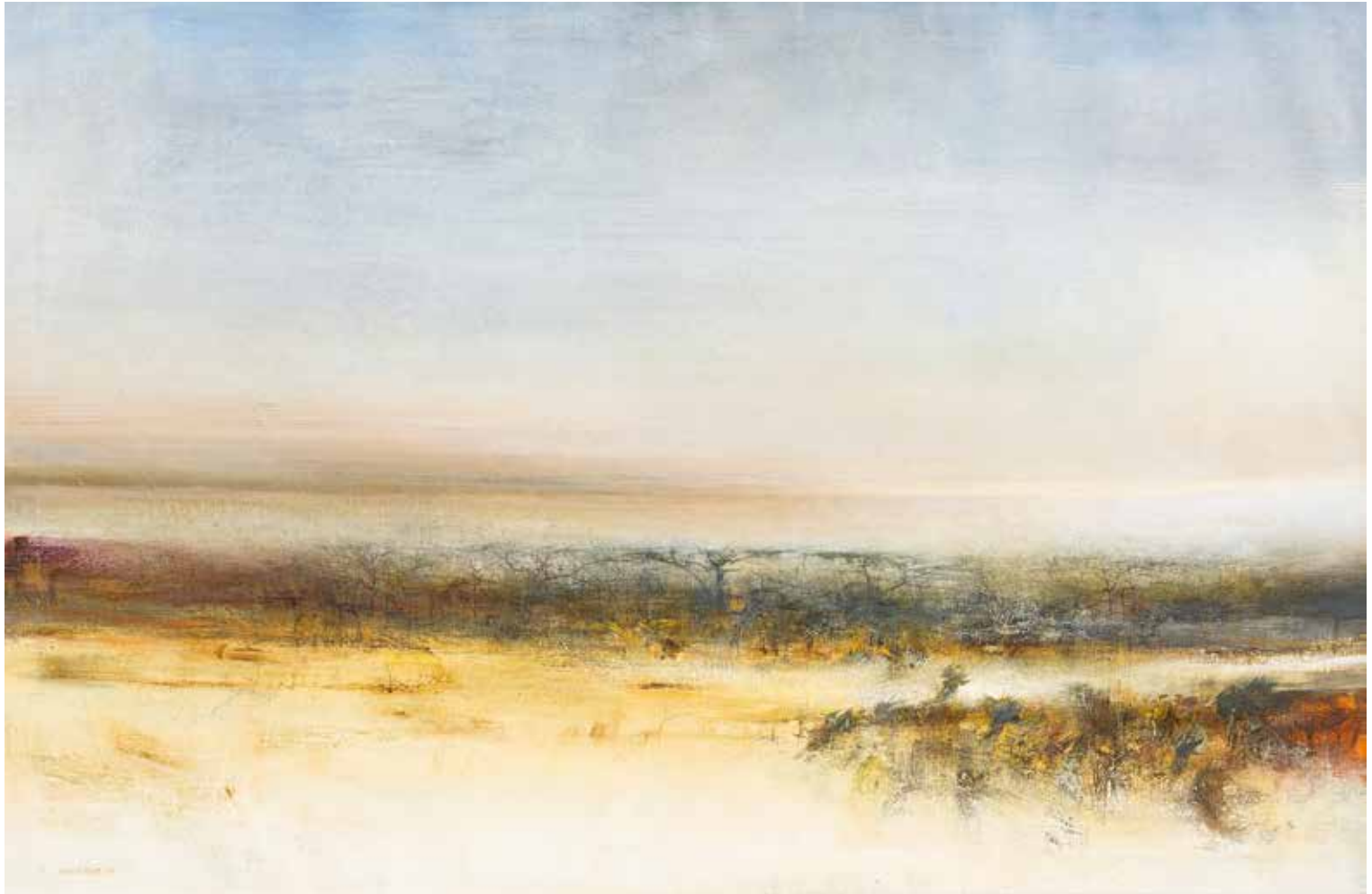
Harold Voigt Schagen (Near Nelspruit) 1978 oil on canvas 112 by 182 cm R70 000 – 90 000