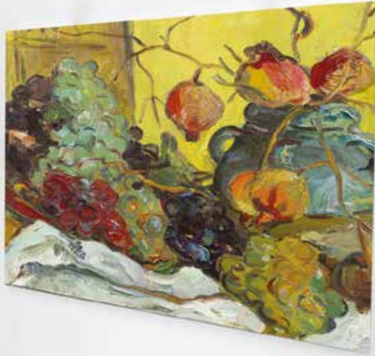
Irma Stern Still Life with Pomegranates 1947 Oil on canvas

iTOO Artinsure provides bespoke insurance solutions to the collecting community and the businesses that service them.