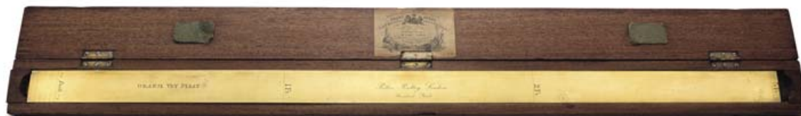
415 A brass 'Standard Yard' measure, Oranje Vry Staat, Potter, Poultry, London, 19th century

engraved with measurements, ORANJE VRY STAAT, and the makers' name, 93 cm long; cased, with makers' paper label, 99 cm long