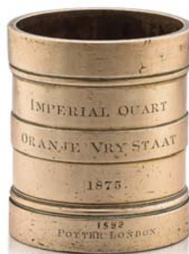
414 A brass Imperial Quart measure, Oranje Vry Staat, Potter, London, 1875

inscribed 'IMPERIAL QUART ORANJE VRYSTAAT, 1875, POTTER. LONDON, 1592', 13,7 cm high