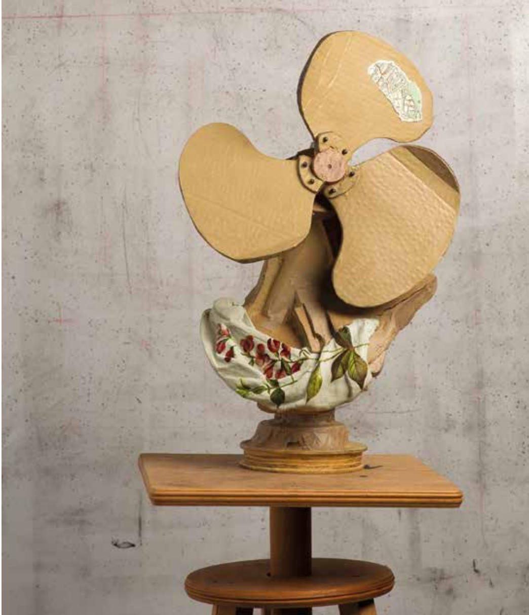
William Kentridge Sister Fan