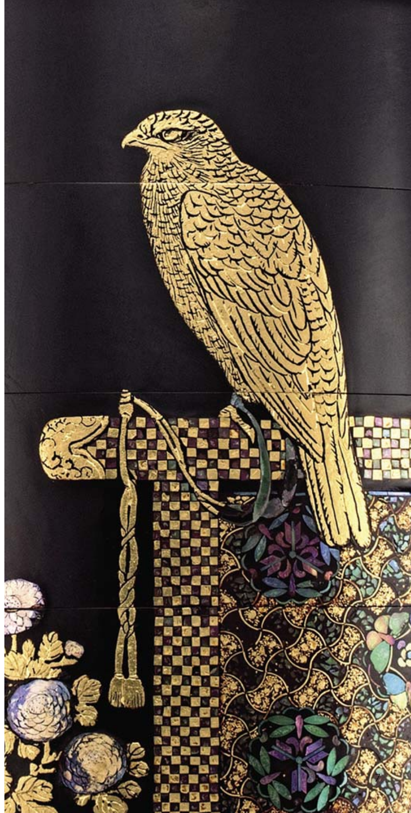
Lot 267 Japanese lacquer four-case inro, 19th century (detail)