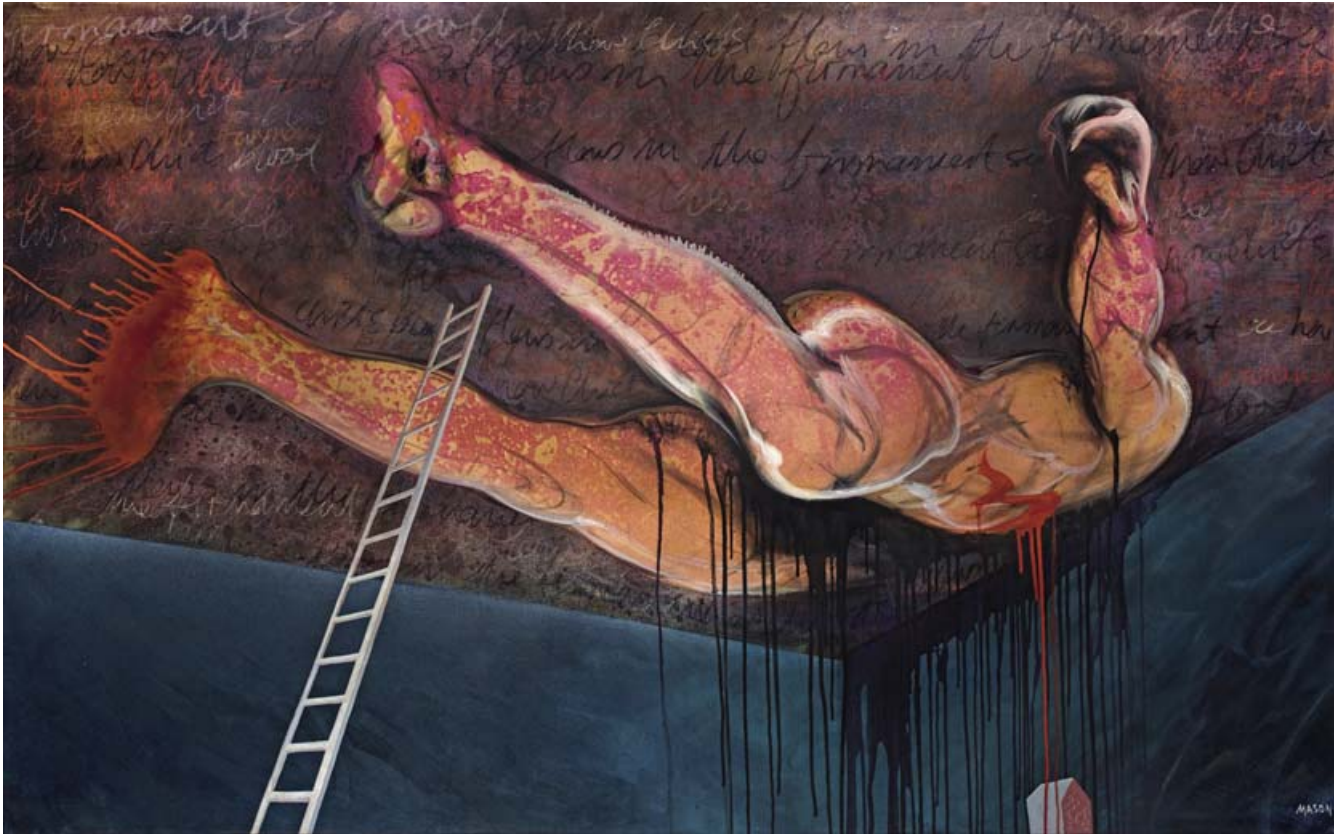
Dead Christ at Montanino, Private Collection

10 October 2018 is the 80th anniversary of the birth of this renowned artist