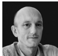
Sean O'Toole Art Research & Text