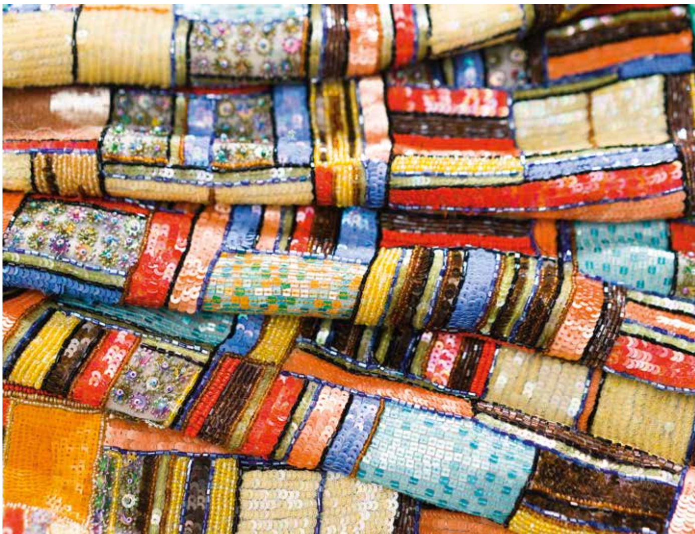
Escada, Sequins Phantasy R4 000 – 6 000