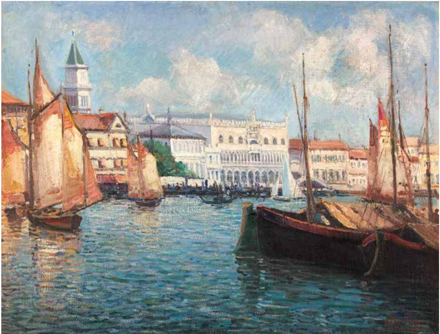
Hugo Naudé, Venice R300 000 – 500 000