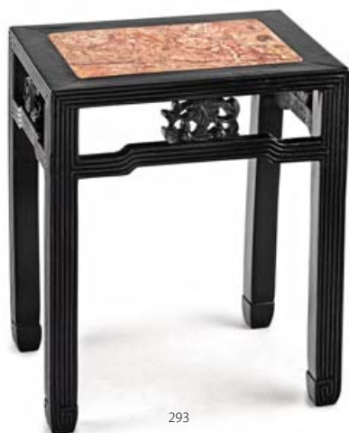
293 A Chinese ebonised hardwood and marble side table, late 19th/early 20th century

the rectangular top inset with a rouge marble plaque above an open frieze centred by a foliate panel, on reeded square-section legs, 51cm high, 42cm wide, 31cm deep