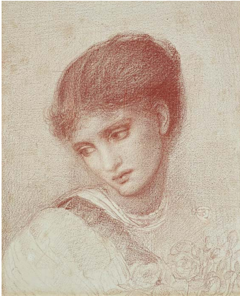
Sir Edward Coley Burne-Jones, Portrait of Maria Zambaco Sold £112 500 (R2 million) 14 July 2016