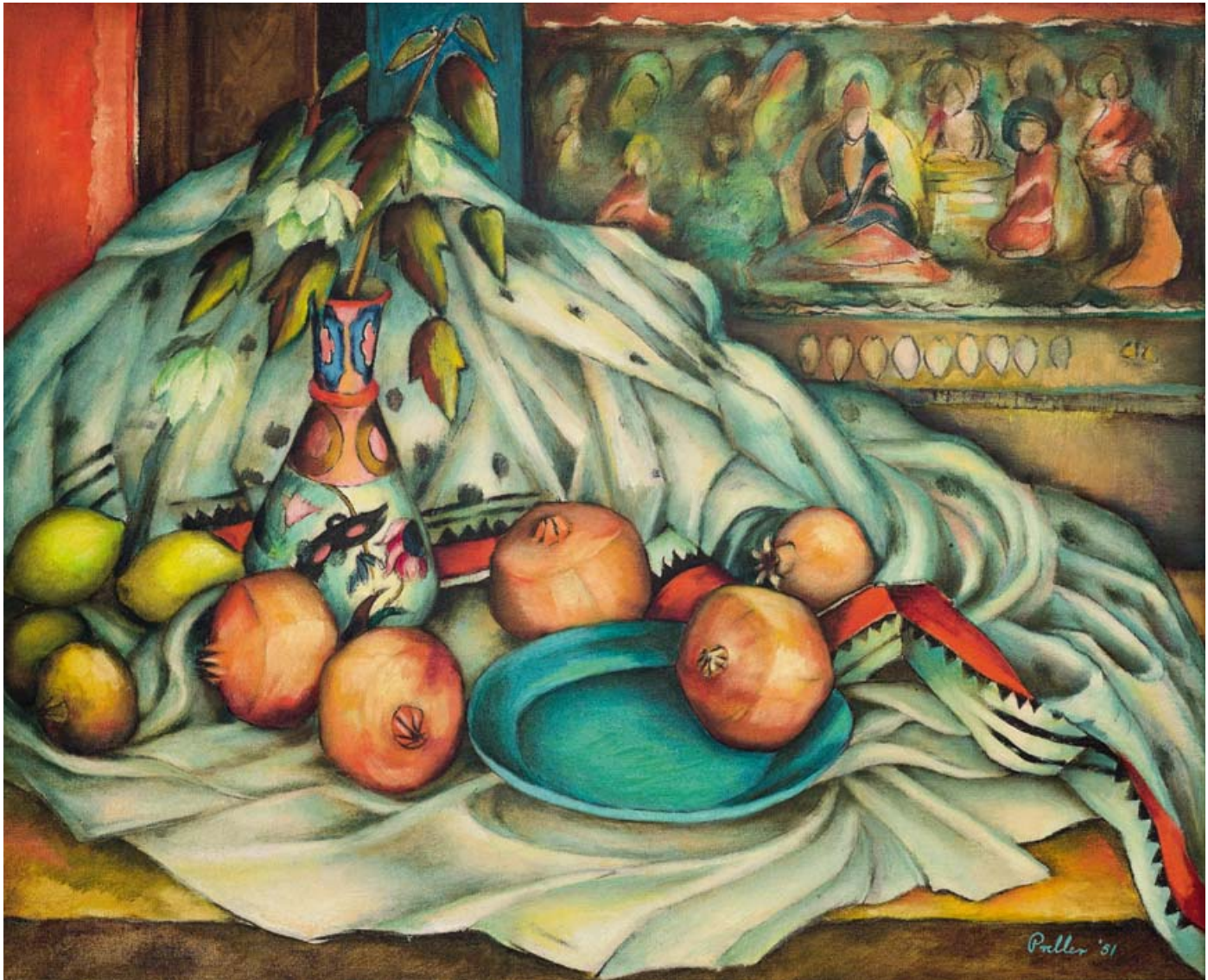
Alexis Preller, Still Life with Pomegranates R4 000 000 – 5 000 000