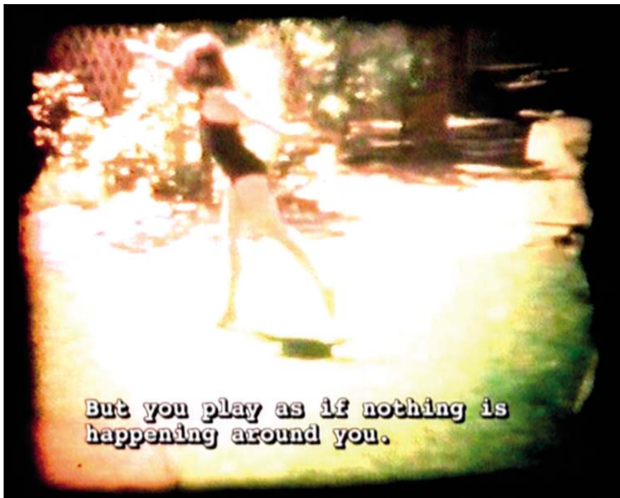
Penny Siopis . From My Lovely Day . 2016 . Inkjet print on cotton paper . Paper size: 44 by 50cm . Edition of 100 + 2 AP . R3 000*

GROW YOUR COLLECTION WITH WORKS BY NOTED SOUTH AFRICAN ARTISTS