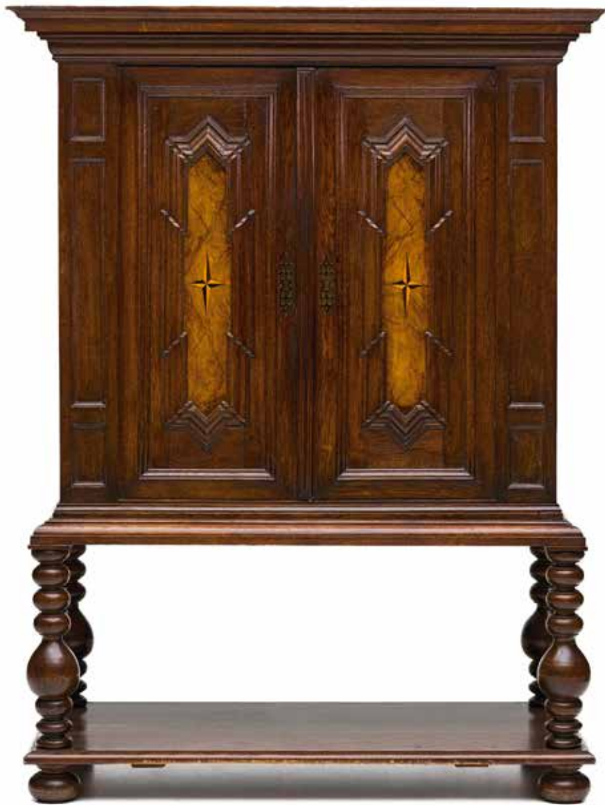
An oak and walnut cabinet-on-stand, 18th/19th century R20 000 – 25 000