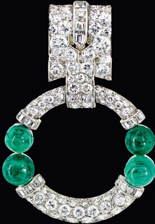
Art Deco diamond and emerald brooch Van Cleef & Arpels Sold R397 880