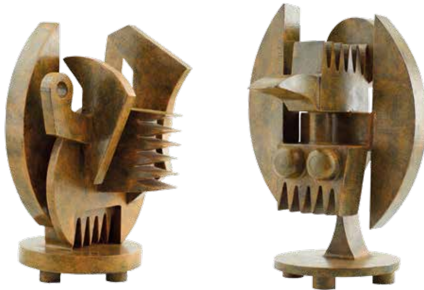
July 2015 Online: Edoardo Villa Butri sold for R100 706; Edoardo Villa Piero sold for R70 260

Next auction of Fine & Decorative Arts and Books February 2016 Consignments close: 31 January 2016