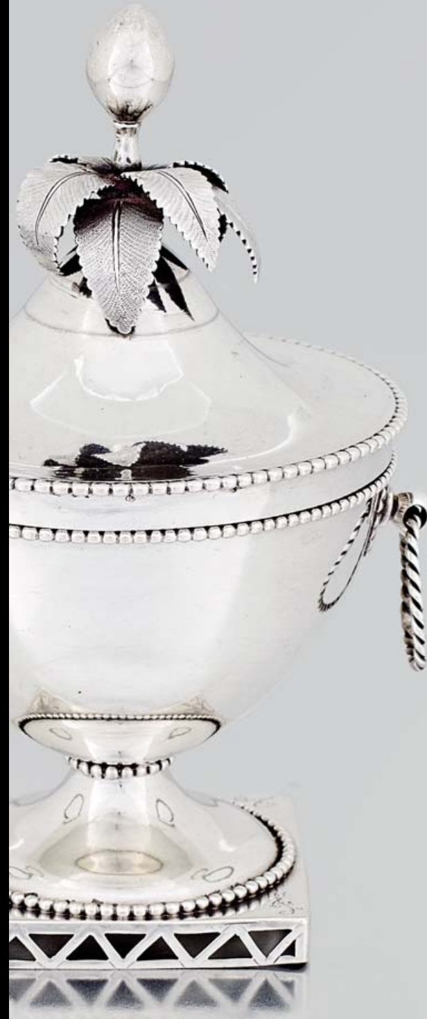
Lot 292 A Cape silver two-handled sugar bowl and cover, unknown maker HNS, late 18th century (detail)

Entries close 2 weeks before the sale opens