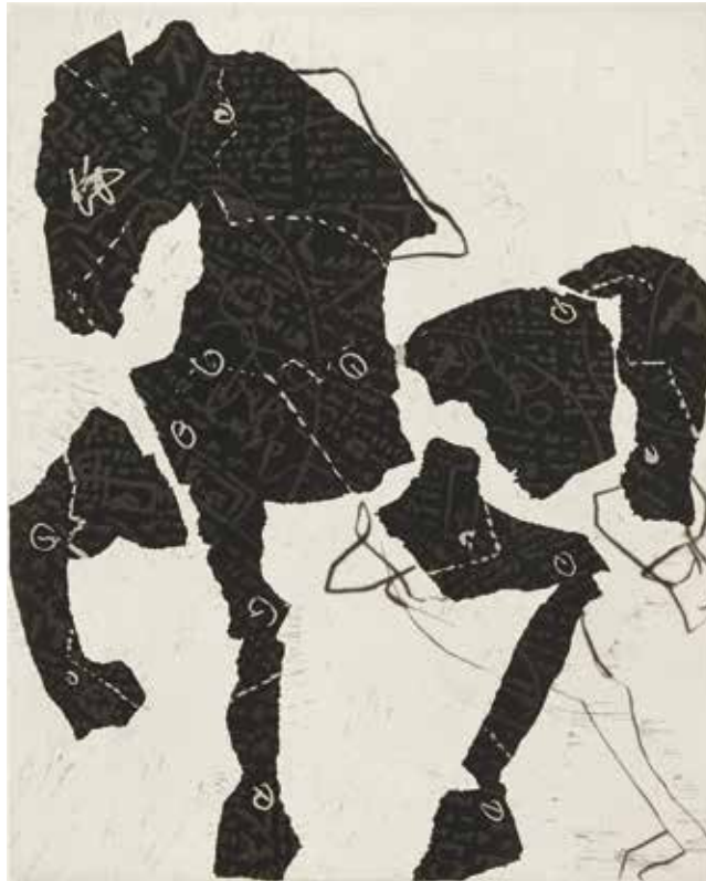
April 2015 Online: William Kentridge Handspring II (Horse) sold for R38 643

Rethink the way you buy art, bid online at www.straussartonline.co.za