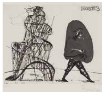
William Kentridge Nose 3 Sold for R38 643