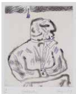
Robert Hodgins Godfather Sold for R14 638

The first exclusively online-only time-limited art and antiques auction website in South Africa