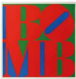
Kendall Geers After Love Sold for R15 223