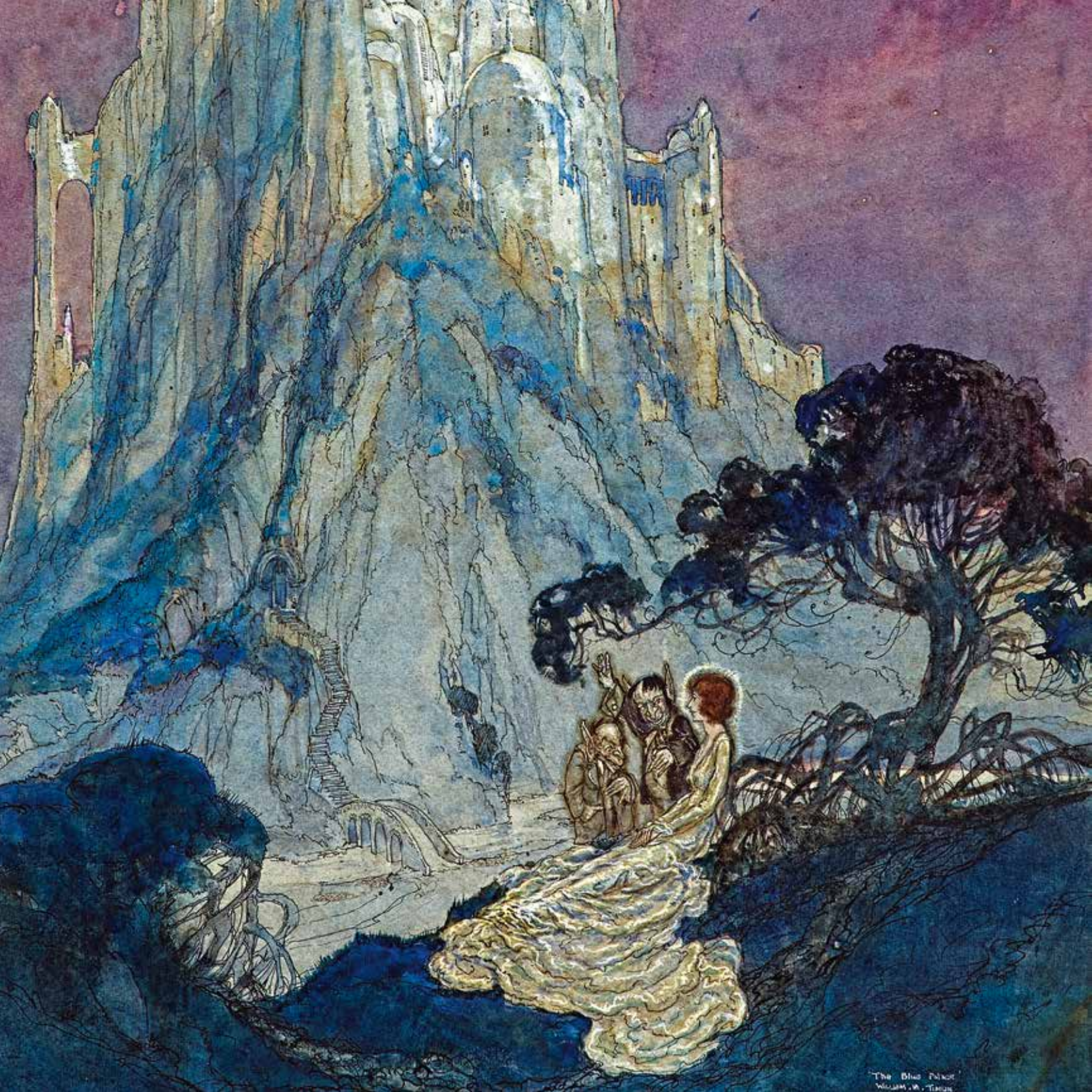
The Blue Palace WILLIAM W. THOMAS