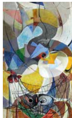
Amando Baldinelli The Catch R3 000 – 5 000