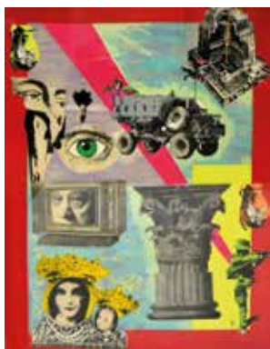
Steven Cohen Untitled R15 000 – 20 000

The first exclusively online-only time-limited art and antiques auction website in South Africa