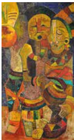
Speelman Mhlangdu Figures with Pots R5 000 – 7 000