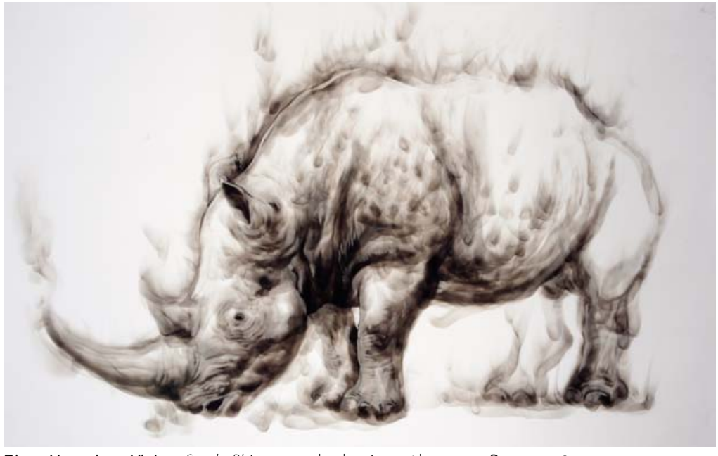
Diane Veronique Victor, Smoke Rhino smoke drawing, 96 by 144cm R50 000 – 80 000

Preview and drinks 5.30 – 7.00pm 7.00 pm Charity Art sale