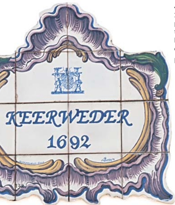
Plaque above Dome door