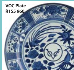
VOC Plate R155 960