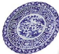
11. 17c Chinese Swatow Blue and White Dish R20 000