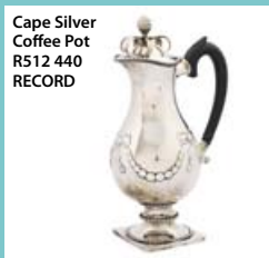
Cape Silver Coffee Pot R512 440 RECORD