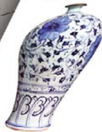
10. Chinese Hangxi Period Blue and White Vase R35 000