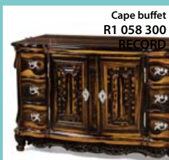
Cape buffet R1 058 300 RECORD