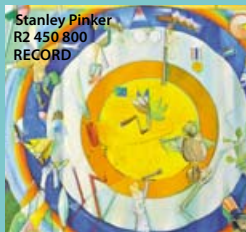
Stanley Pinker R2 450 800 RECORD