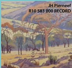
JH Pierneef R10 583 000 RECORD