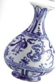
12. 18c Provincial Chinese Blue Painted Gourd Shaped Vase R50 000