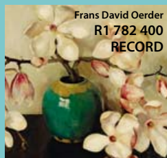
Frans David Oerder R1 782 400 RECORD