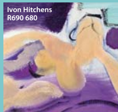
Ivon Hitchens R690 680