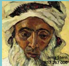
Irma Stern R17 267 000