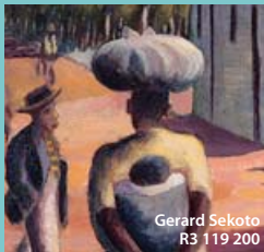
Gerard Sekoto R3 119 200