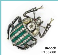
Brooch R133 680