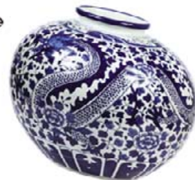
13. Fine Bulbous Ming Dynasty Blue and White Vase R100 000