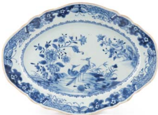
281 part lot