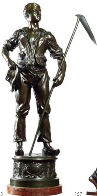
155 part lot