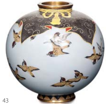
43 part lot