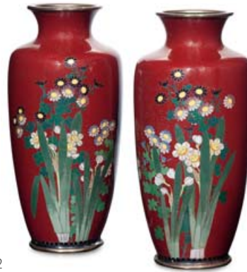
42 part lot