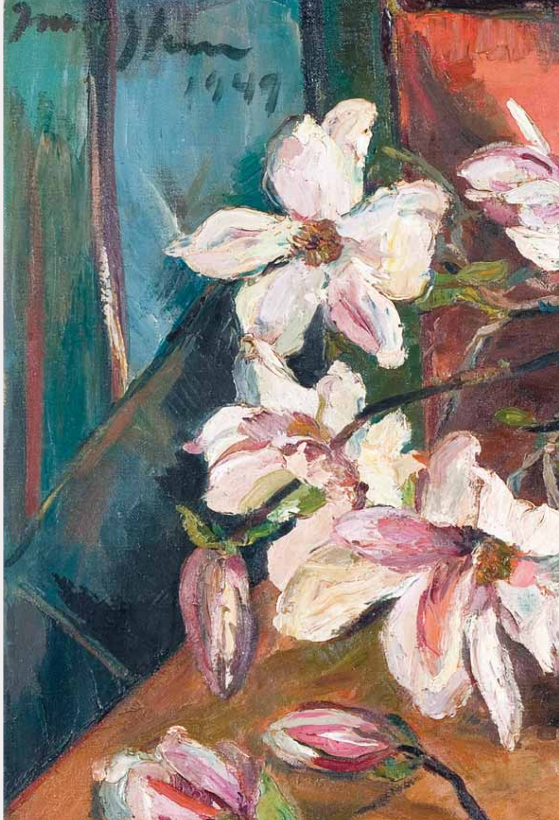
Irma Stern Magnolias in an Earthenware Pot Sold for R7 241 000 A world record for a still life by the artist