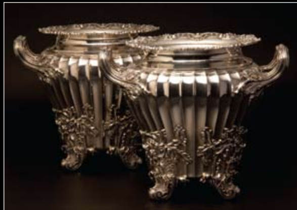
A Pair of George III Silver Wine Coolers Paul Storr, London, 1819