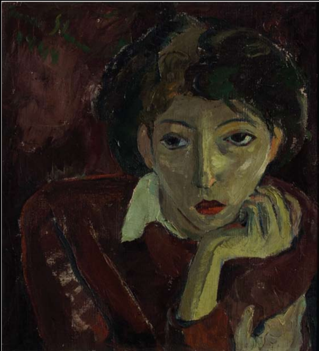
Irma Stern, Carla signed and dated 1944, oil on canvas